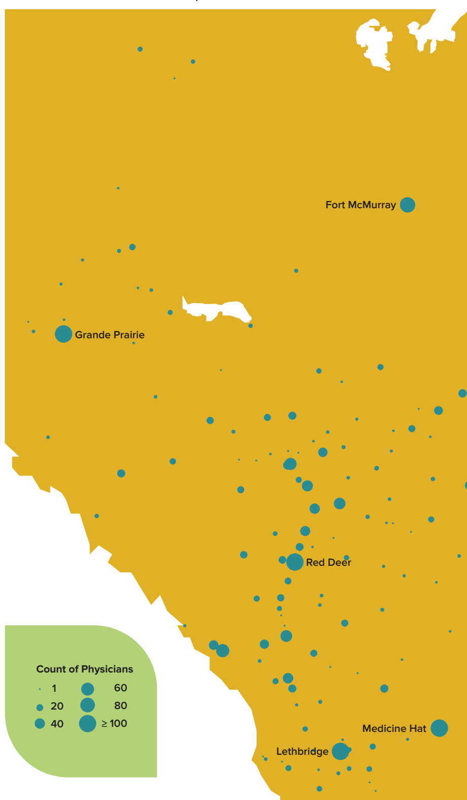
Map shows the distribution of the 2044 rural/regional Alberta Physicians (2013-2014)

Quality healthcare exists outside of Edmonton and Calgary.